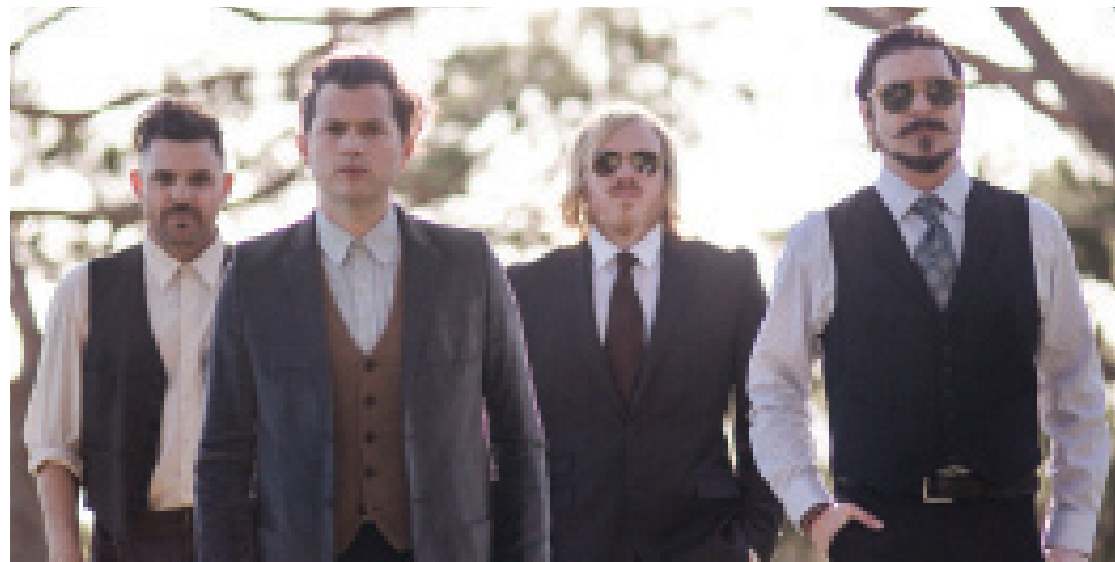
Rival Sons from left: Michael Miley, Jay Buchanan, Dave Beste and Scott Holiday.

Lead singer Jay Buchanan tells us why being in a rock band isn't about the girls, money or attention for him.